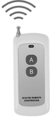
③ WIRELESS REMOTE CONTROL